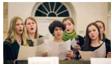
Choir rehearsal in the Max-Reger-Hall