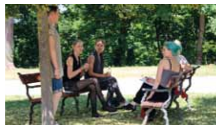
Conversation in the park