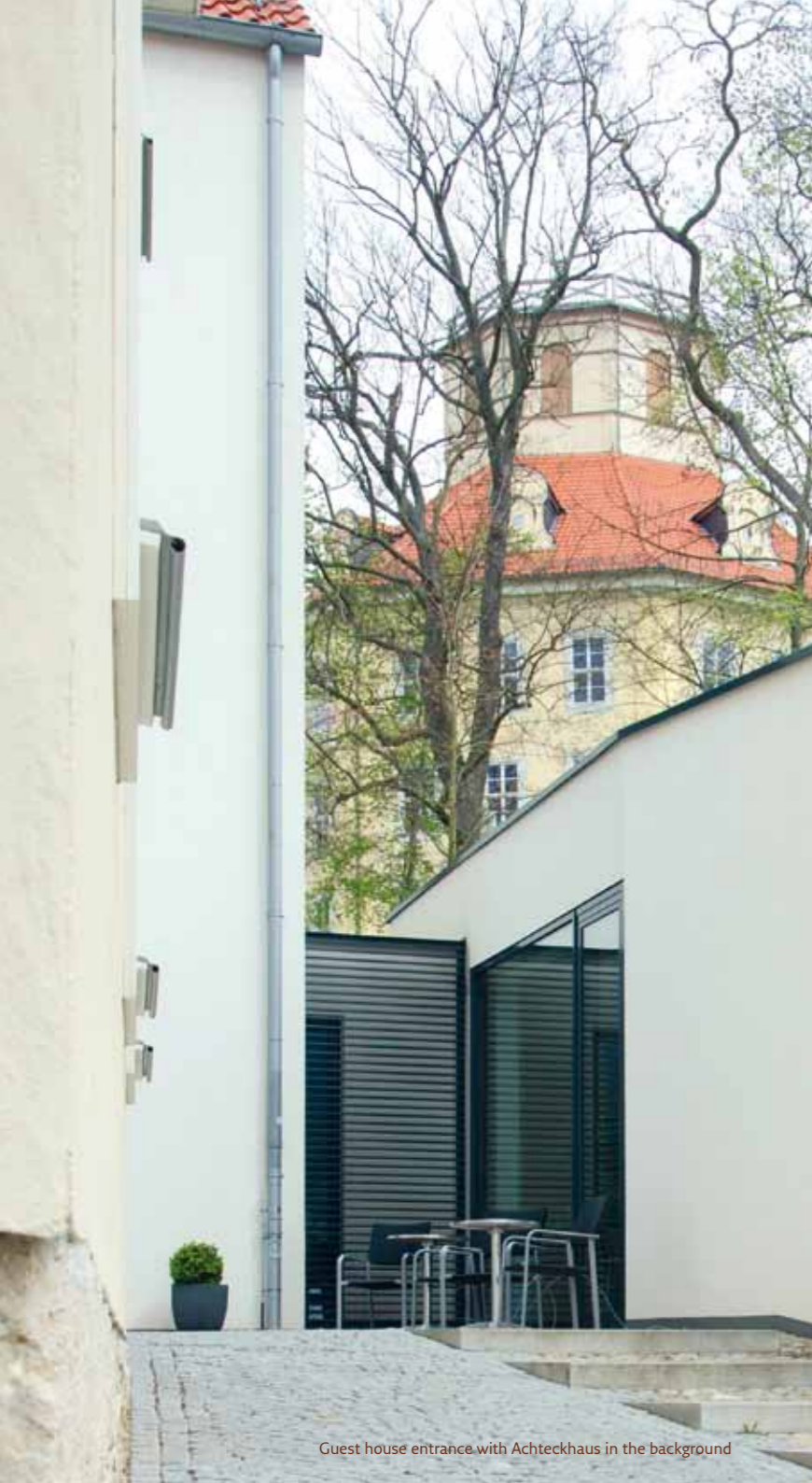
Guest house entrance with Achteckhaus in the background