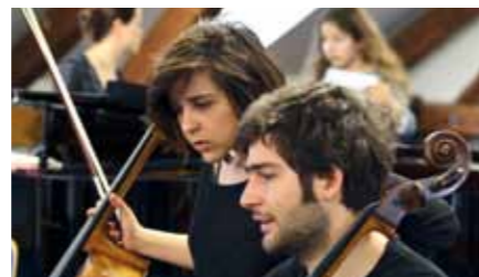
Master class students in a rehearsal room