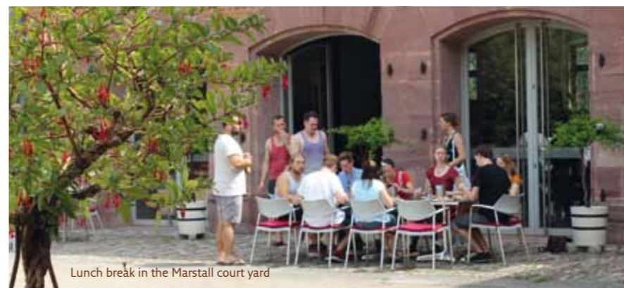
Lunch break in the Marstall court yard

The academy is sponsor of several youth ensembles: Landesjugendbigband Thüringen (Thuringian Youth Big Band), Landesjugendchor Thüringen (Thuringian Youth Choir), Landesjugendensemble für neue Musik Thüringen (Thuringian Youth Ensemble for New Music), Landesjugendorchester Thüringen (Thuringian Youth Orchestra), Landesjugendzupforchester (Thuringian Youth Mandolin and Guitar Orchestra).