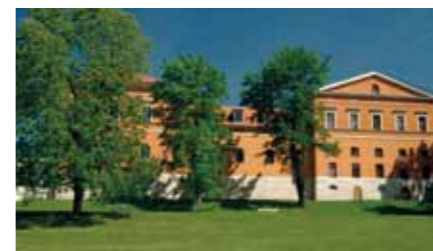
Marstall with palace garden